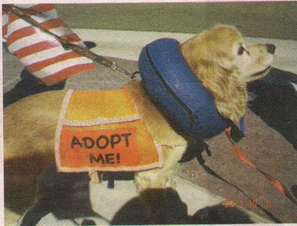
Gigi with her cone recovering from her first surgery

S econd Chance takes in Cocker Spaniels that need new homes, provide medical care, training for behavioral issues and find them a loving home. Founded in 2003, Second Chance has found homes for over 550 adoptable dogs and offered Sanctuary homes for over 60 non-adoptable